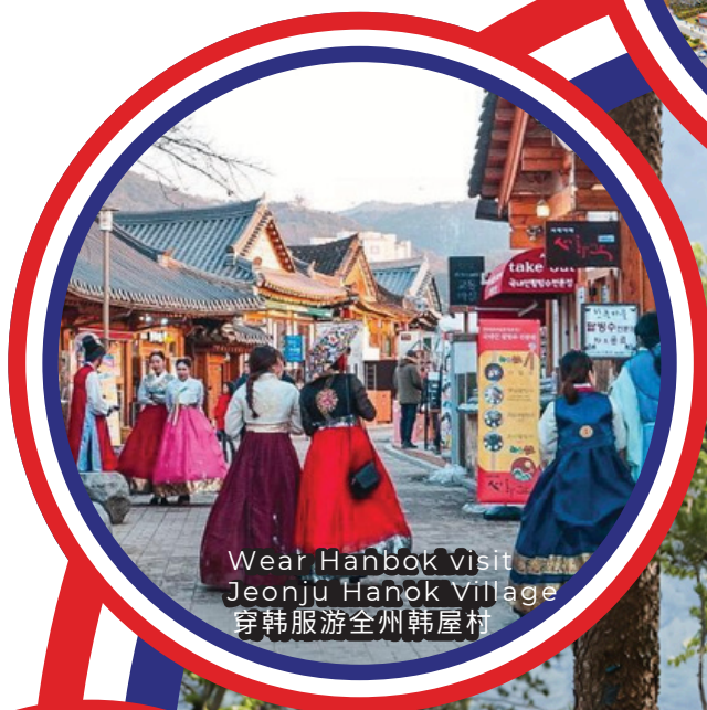
Wear Hanbok visit Jeonju Hanok Village 穿韩服游全州韩屋村