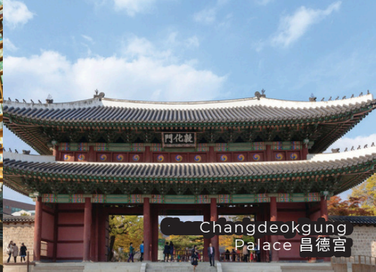
Changdeokgung Palace 昌德宫