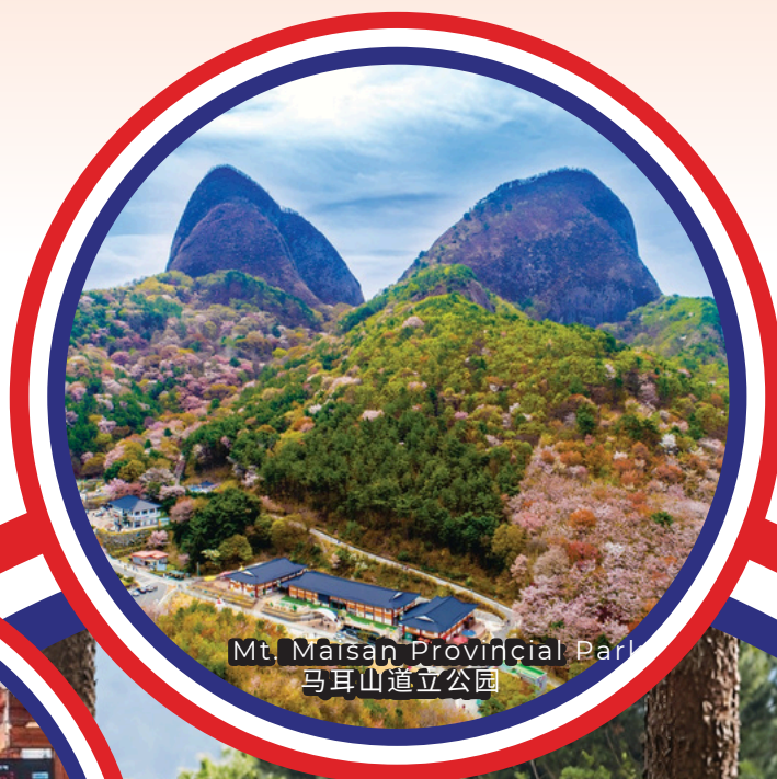
Mt. Maisan Provincial Park 马耳山道立公园