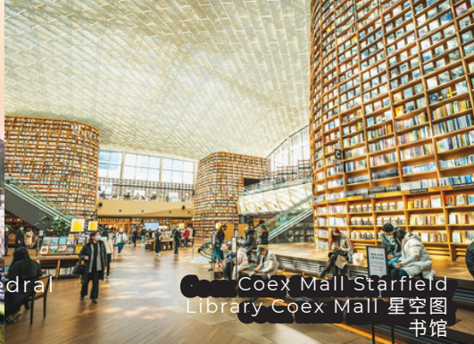
Coex Mall Starfield Library Coex Mall 星空图书馆