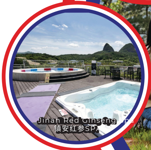
Jinan Red Ginseng Spa 镇安红参SPA

行程次序，以当地旅社安排为准。 Sequences of Itinerary are subject to local arrangement.