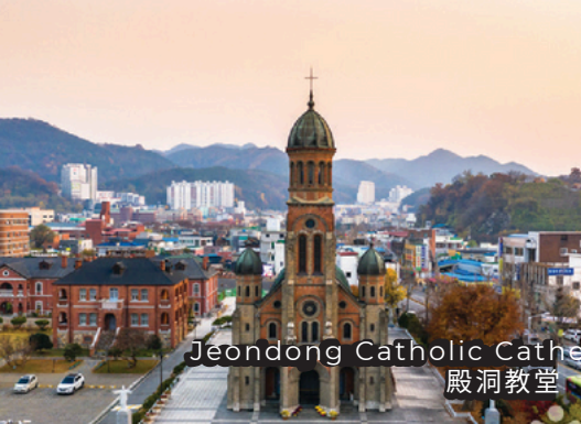
Jeondong Catholic Cathedral 殿洞教堂