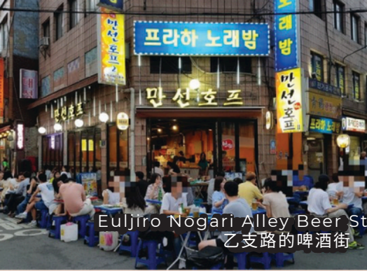
Euljiro Nogari Alley Beer Street 乙支路的啤酒街