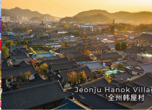
Jeonju Hanok Village 全州韩屋村